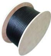
1000' Wood Reel Weight: 49 lbs.