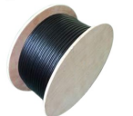
1000' Wood Reel Weight: 19 lbs.