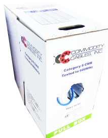
1000' Pull Box Weight: 29 lbs.