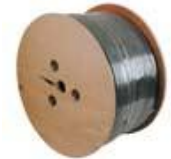
1000' Wooden Reel